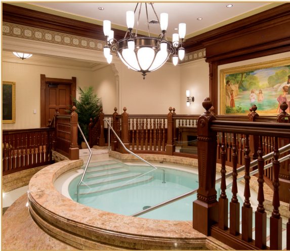
Baptistry: Ordinances such as baptism are performed on behalf of ancestors who died without receiving them. Baptisms for the living are not performed in the temple but in local meetinghouses.

J ESUS CHRIST DEMONSTRATED His commitment to obey all of God's commandments when He was baptized. Jesus further taught that baptism is required to enter the kingdom of God. But what about people who die without being baptized? What hope do they have of returning to God's presence? God has provided a way for them to also receive all His blessings.