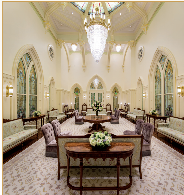
Celestial room: This room symbolizes the peace and joy of the kingdom of God, where families can live together forever with our Father in Heaven and His Son, Jesus Christ.

The scriptures record that God has blessed His children at temples and in other holy places since the earliest days of the world. Modern temples have purposes similar to those of biblical temples—they are places of peace, inspiration, and learning, where sacred ceremonies, called ordinances , take place.